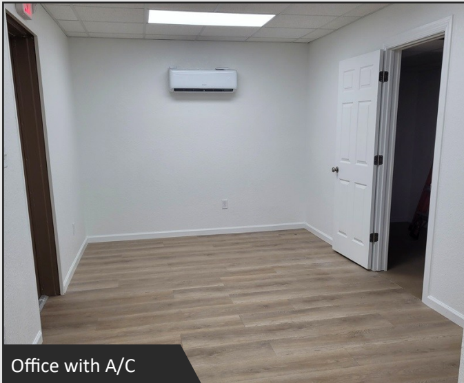
Office with A/C