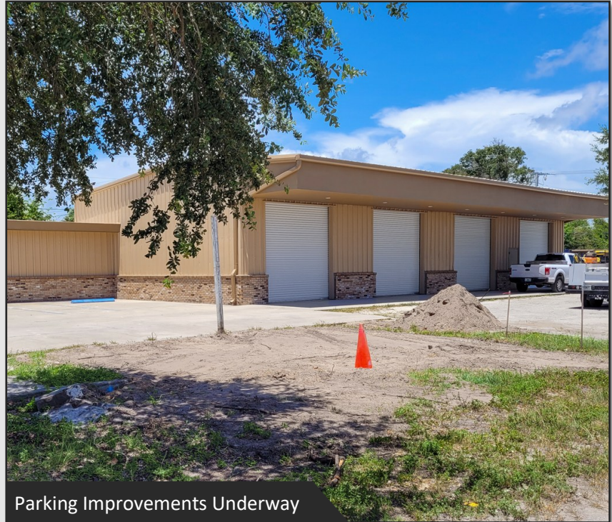
Parking Improvements Underway