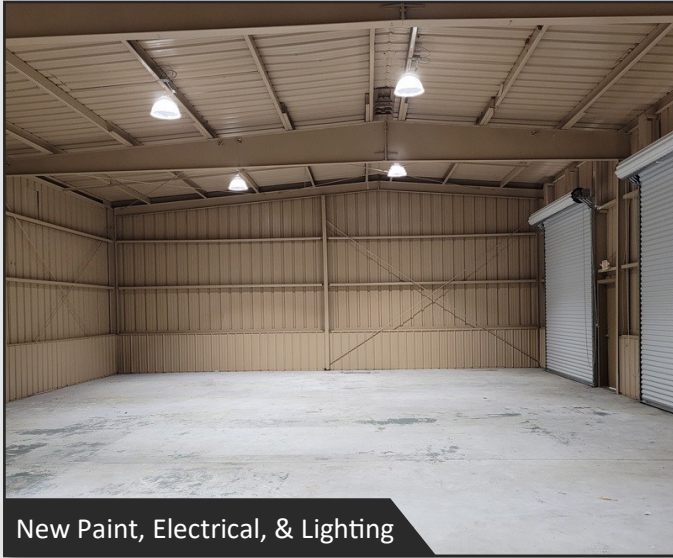
New Paint, Electrical, & Lighting