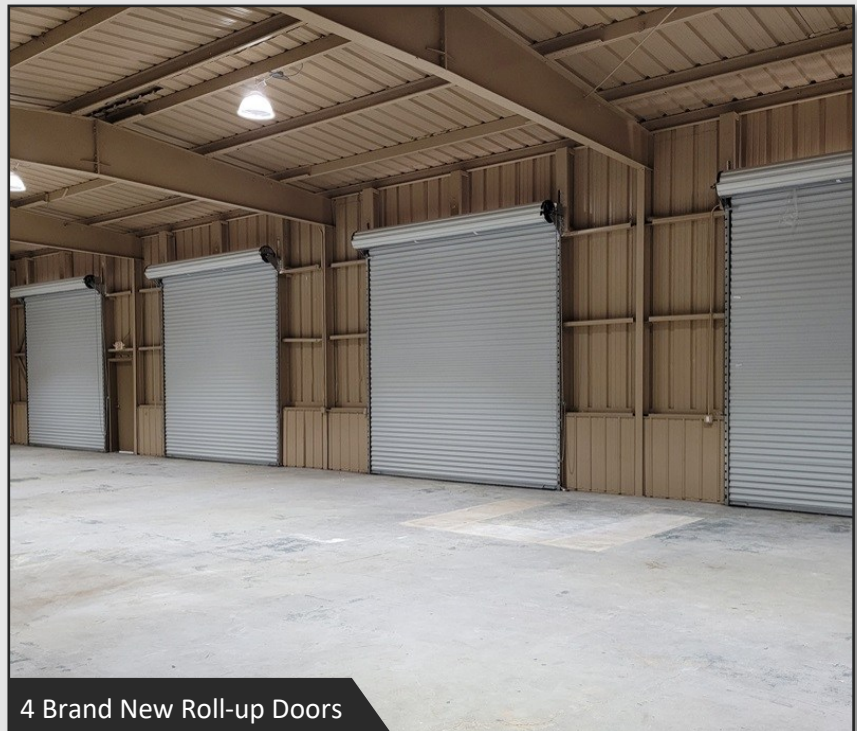
4 Brand New Roll-up Doors