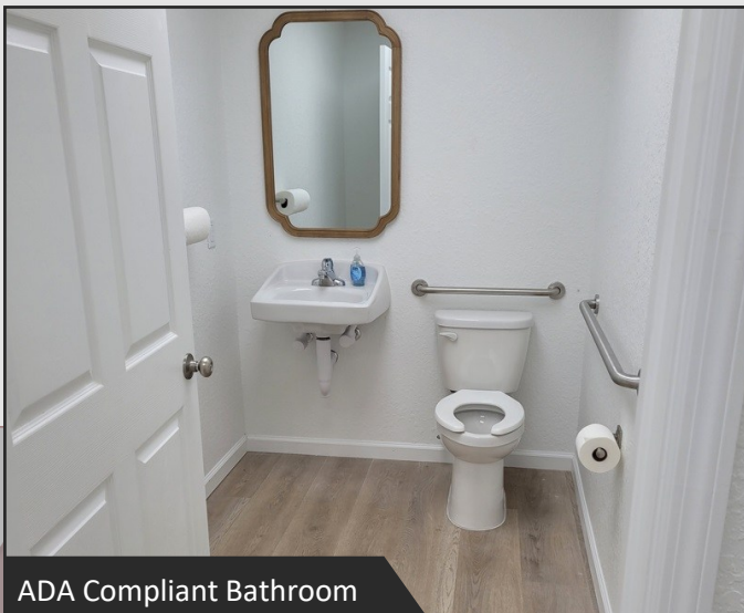
ADA Compliant Bathroom